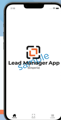
Lead Manager App